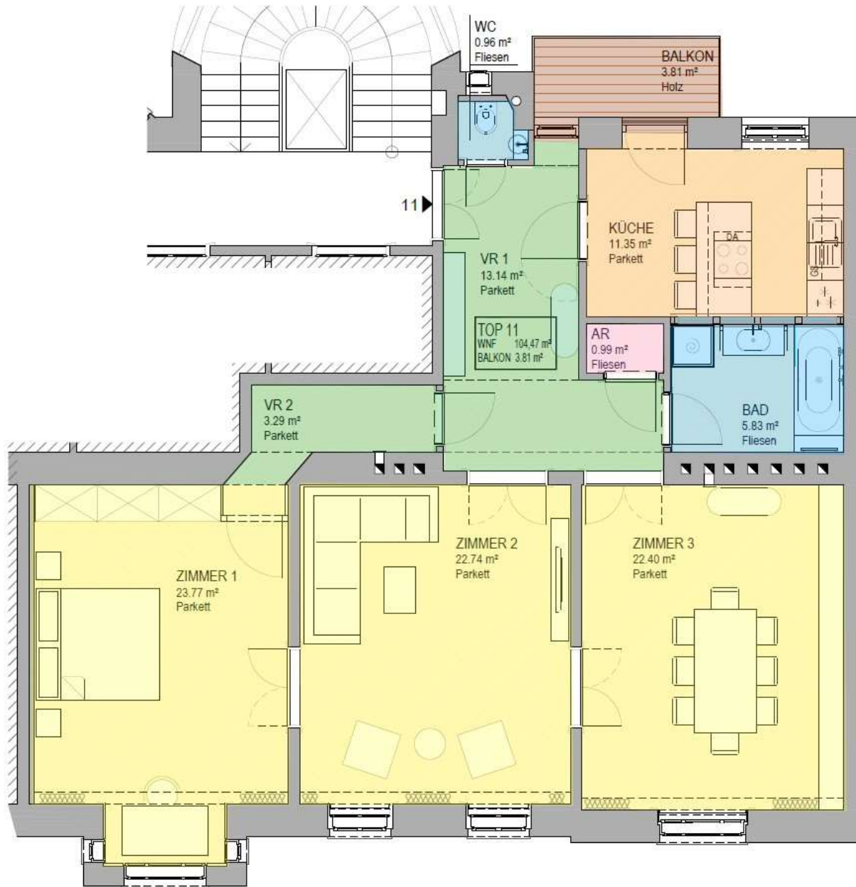
GRUNDRISS 2.STOCK / TOP 11